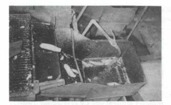
Fig. 2: Addition of water while rasping the roots

facilitates rupture of cell walls and release of starch granules (Ahmed, 1978). This is carried out by pressing the roots against a swiftly moving surface provided with sharp protrusions. A large quantity of water is added to the roots (Fig. 2) during this process. The cell walls get ruptured during rasping and the whole root is turned into a mass in which substantial portions of the starch granules are released. It is difficult to remove all the starch in a single operation even with efficient rasping devices. Therefore, the pulp is subjected to a second rasping process after straining. Rasping is usually done in machines using a wooden roller over which the sheet metal rasping surfaces are nailed with the burrs facing outward.