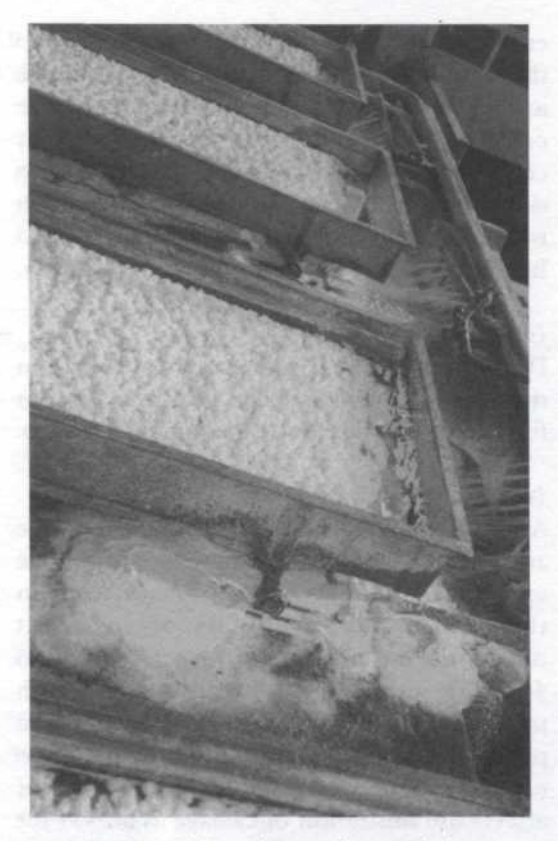
Fig. 3: Addition of water when straining the tapioca pulp

After rasping, the pulp is screened in the shaking screens (Fig. 3). In separating the pulp from the free starch, a liberal amount of water is added to the pulp as it is delivered by the rasper and the resulting dispersion is stirred vigorously before screening. The fresh pulp after mixing with water in distribution tanks is transferred by pipes to the higher end of the screen. During screening, the dispersion passes through a set of screens with increasing fineness, the first one retains the coarse pulp, the others the fine particles. The 'overs' from the first screen are returned to the fine rasp and then returned for re-screening.